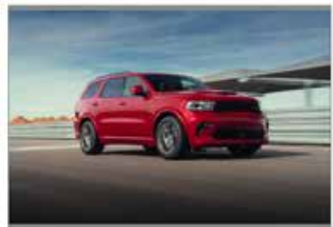
2021 Dodge Durango