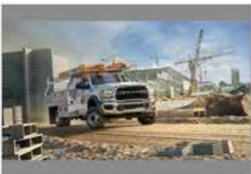
2021 Ram Chassis Cab