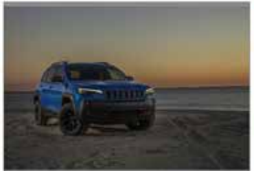
2021 Jeep Cherokee