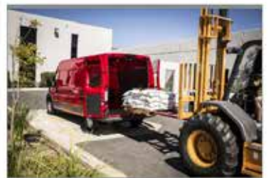
2021 Ram ProMaster