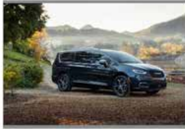
2021 Chrysler Pacifica