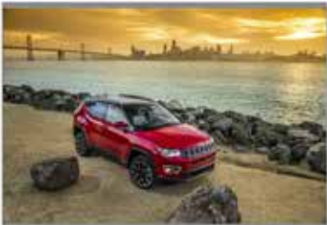
2021 Jeep Compass