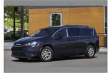
2021 Chrysler Voyager