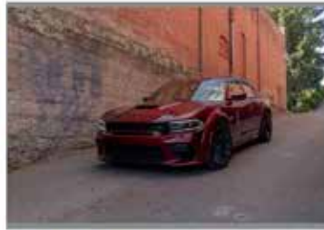
2021 Dodge Charger