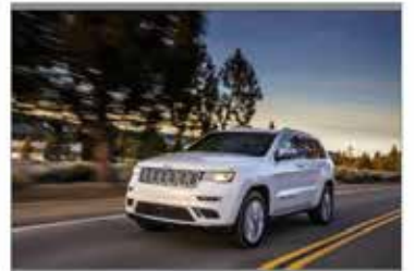
2021 Jeep Grand Cherokee