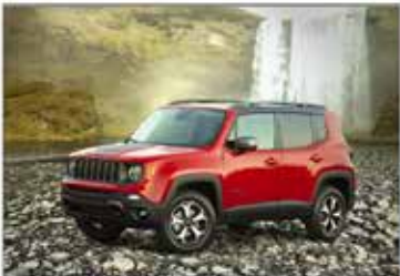
2021 Jeep Renegade