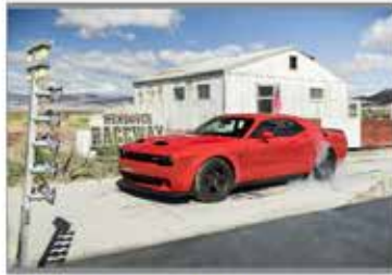
2021 Dodge Challenger SRT