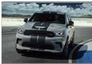
2021 Dodge Durango SRT