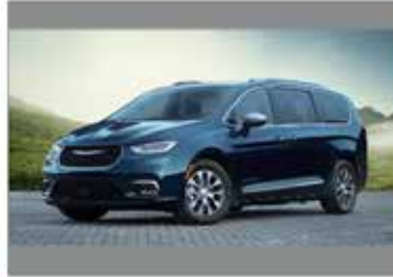
2021 Chrysler Pacifica Hybrid