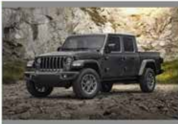
2021 Jeep Gladiator