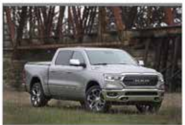
2021 Ram 1500