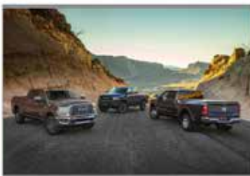
2021 Ram Heavy Duty