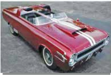
2021 Chrysler 300