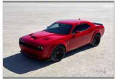
2021 Dodge Challenger