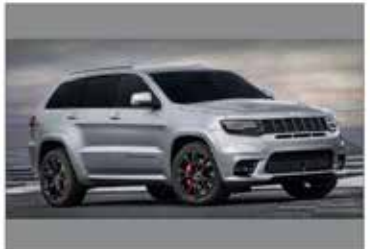
2021 Jeep Grand Cherokee SRT