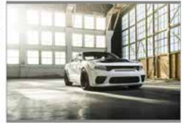
2021 Dodge Charger SRT