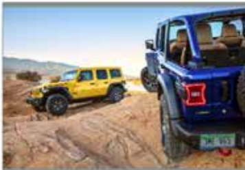
2021 Jeep Wrangler