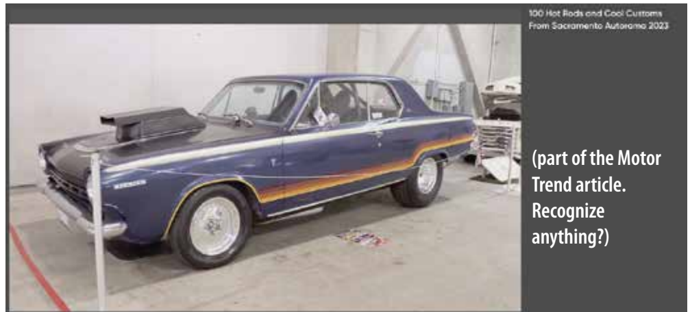
100 Hot Rods and Cool Customs From Sacramento Autorama 2023

This extensive photo gallery includes action from every corner of the 2023 Sacramento Autorama. Don't forget to check out HOT ROD's gallery of Sacramento's top custom cars. There's more to come, including the contenders and big winners in the most prestigious classes.