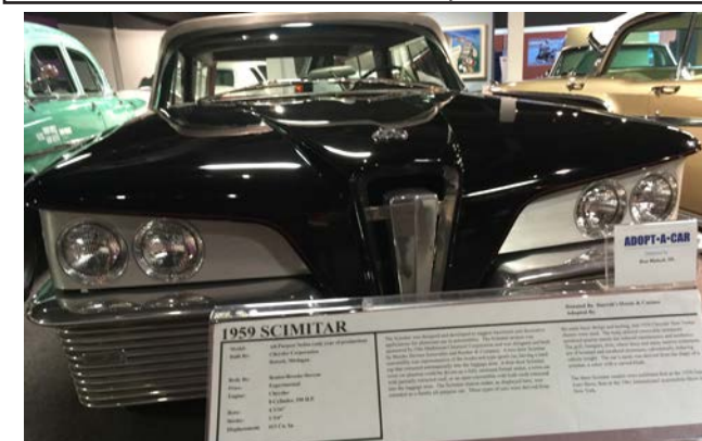
1959 Chrysler Scimitar all aluminum body