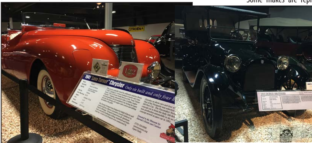
Lana Turner's 1941 Chrysler