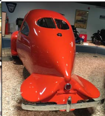
name this car