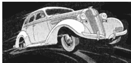
THE THRILL OF THE SUPERCHARGER

Whatever the case, Jeep is clearly up to something and until we either get more teasers or full disclosure, we're stuck playing the guessing game. How about it, Jeepers? These are our best guesses but we're keen to hear some other theories on this secret message. Jump into the comments and give it your best shot.