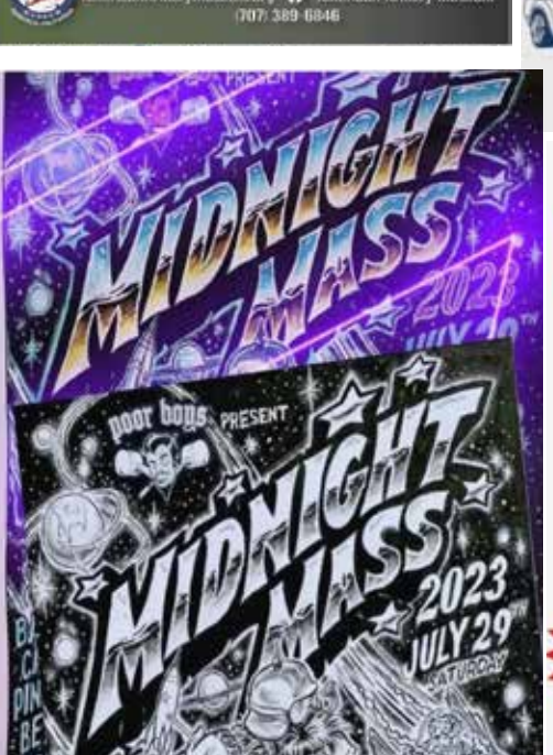
poorboysmidnightmass Saturday, July 29th Woodland Ca Yolo County Fairgrounds, #party... more