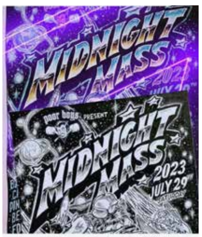
poorboysmidnightmass Saturday, July 29th Woodland Ca. Yolo County Fairgrounds. #party_more