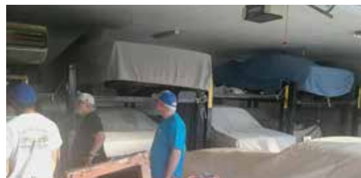
COUNT THE (COVERED) MOPARS